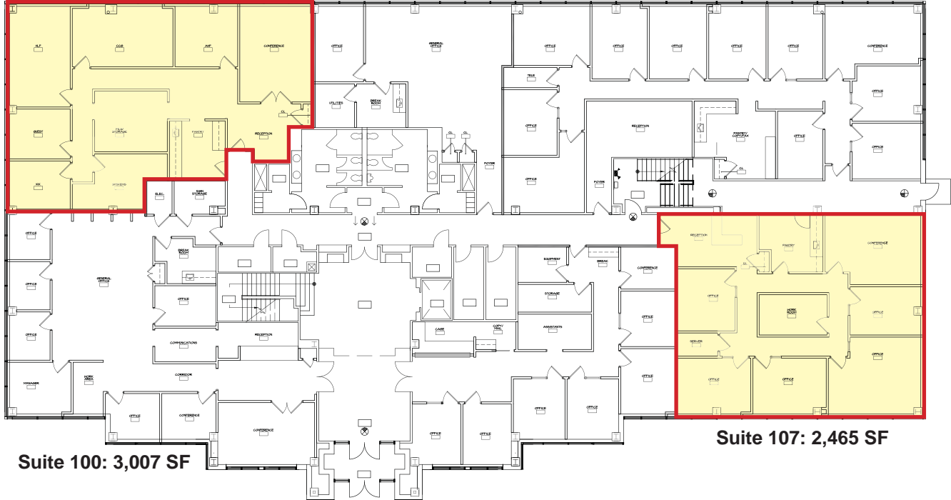
Suite 100: 3,007 SF